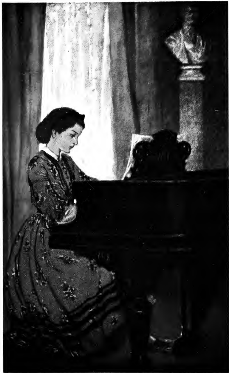
The great drawing-room was haunted by a tuneful spirit that came and went unseen. Page 65.